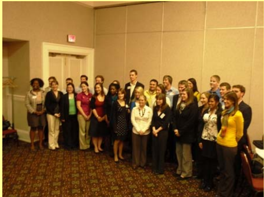
28 Ambassadorial Scholars